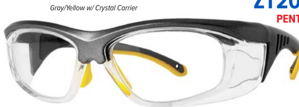
Gray/Yellow w/ Crystal Carrier