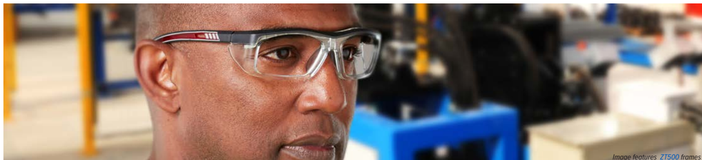
Image features ZT500 frames