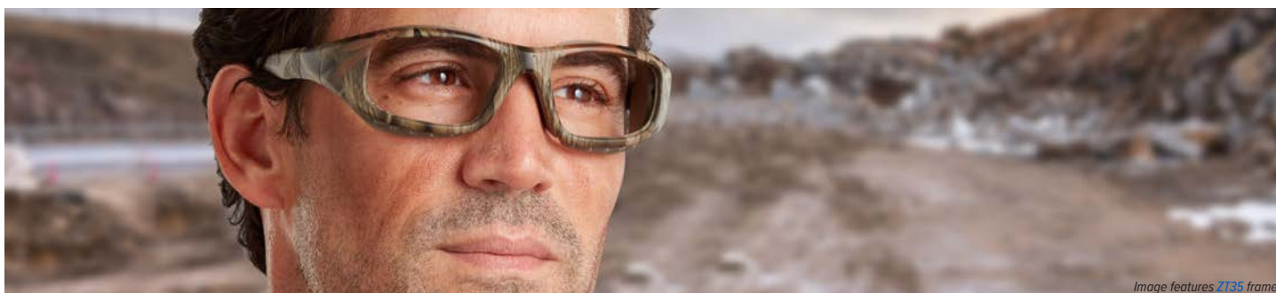
Image features Z135 frames