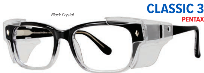
CLASSIC 3 PENTAX

Size 56-18-140 | 58-18-145 | 60-18-145 Color Gunmetal | Black | Gold Temple Standard Side Shields Brow Guard