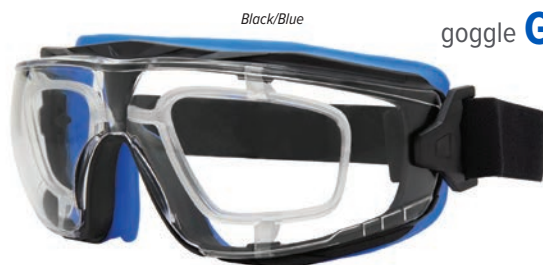
goggle GT20 PENTAX

Includes removable Rx insert Size 50-20-strap (Rx insert) Color Black/Blue Temple Head strap Side Shields Integrated